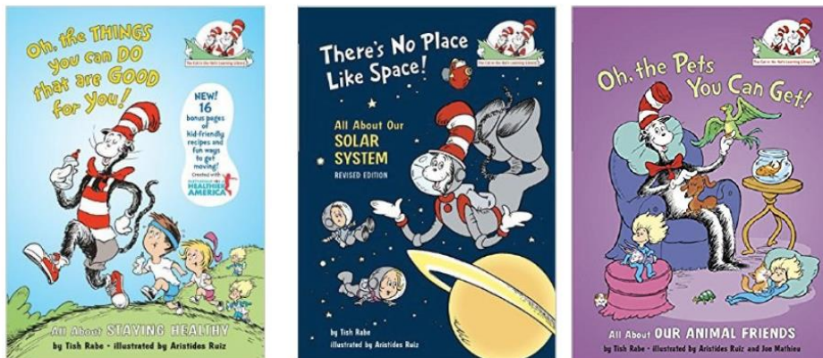
(FAC ¶ 24.)