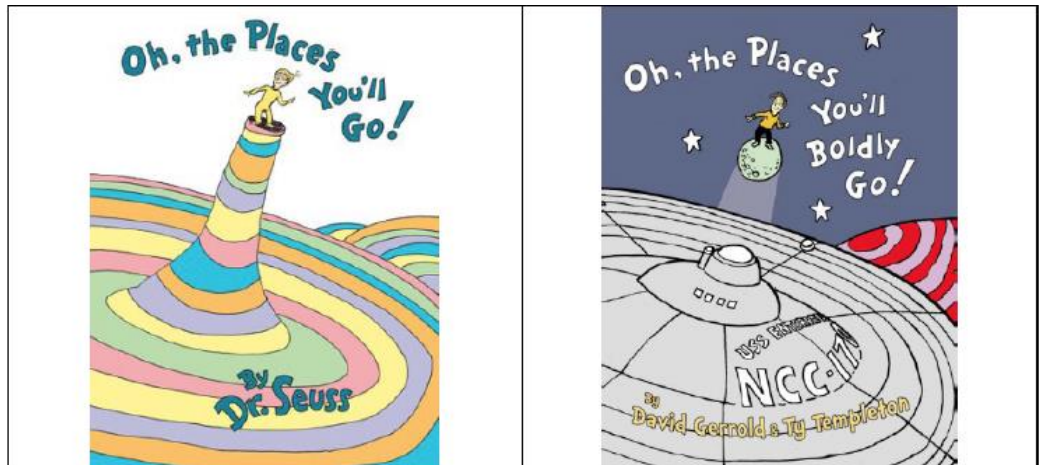
(FAC ¶ 37.)